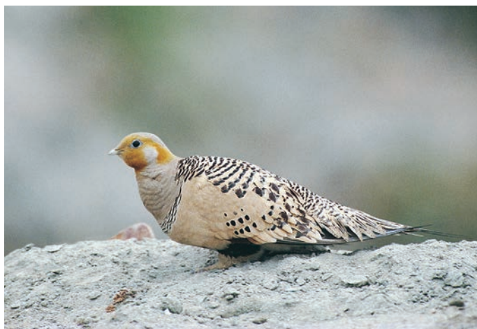
268. Pallas's Sandpiper Syrhaptes paradoxus , Quendale, Shetland, May 1990.