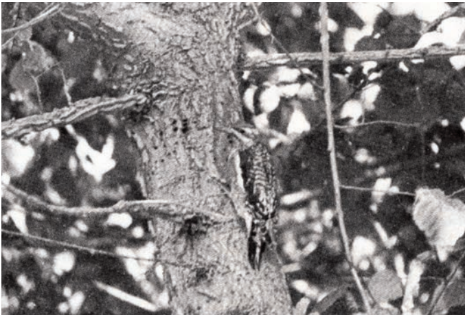
264. First-winter male Yellow-bellied Sapsucker Sphyrapicus varius , Tresco, Scilly, September 1975.