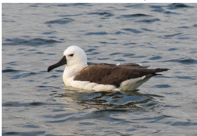
270. Immature Yellow-nosed Albatross Thalassarche chlororhynchos , Manton, Lincolnshire, July 2007.

captured so memorably, as our top choices for that decade. And then for the last decade, when the rarities have become even less predictable, we have unbelievable images of unthinkable seabirds, together with an improbably dramatic image of a Gyr Falcon Falco rusticolus clutching a hapless Little Auk Alle alle .