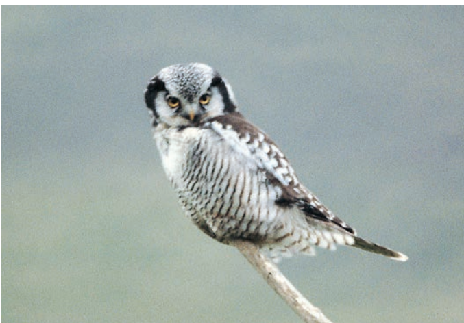
265. Hawk Owl Surnia ulula , Frakkafield, near Lerwick, Shetland, September 1983.