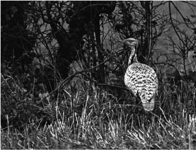
261. Macqueen's Bustard Chlamydotis macqueenii , Hinton, Suffolk, November/December 1962.