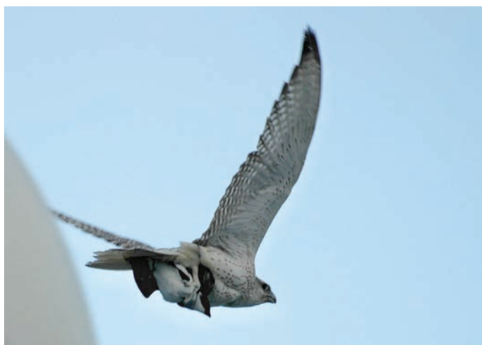
269. First-winter Gyr Falcon Falco rusticolus with Little Auk Alle alle , sea area Fair Isle, west of Shetland, February 2005.