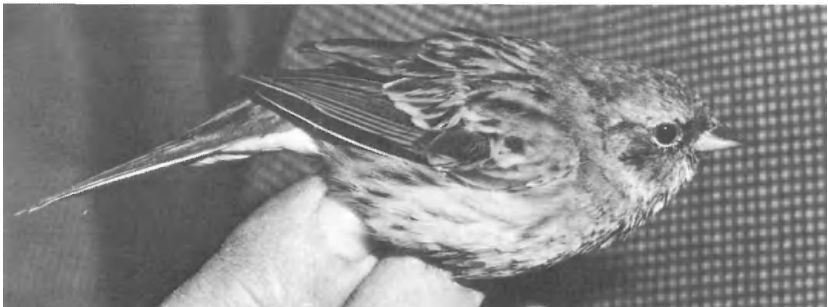
13. Black-faced Bunting Emberiza spodocephala , Netherlands, November 1986 ( Brit. Birds 81: 22) ( Arnoud B. van den Berg )