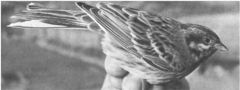
12. Male Pine Bunting Emberiza leucocephalos , Netherlands, November 1988

Pine Bunting Emberiza leucocephalos NETHERLANDS Influx: three between 19th October and 4th November 1987 are twenty-second to twenty-fourth records (plate 12).